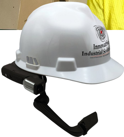
Hard Hat Mounted