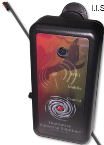
I.I.S. WiFi Mobile Camera