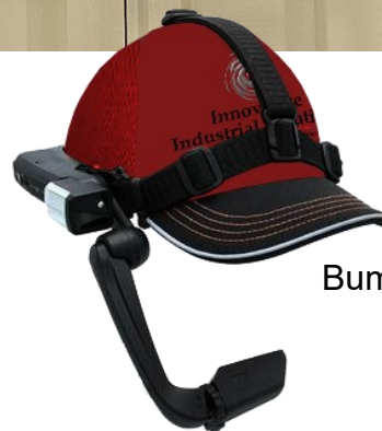
Bump Cap Mounted